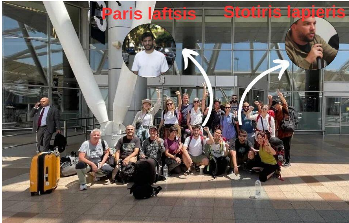
Greek delegation participating in the march